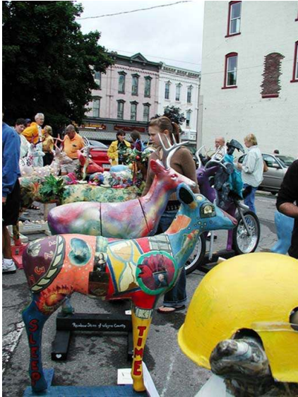
Deer auction at the Park and Shop Lot