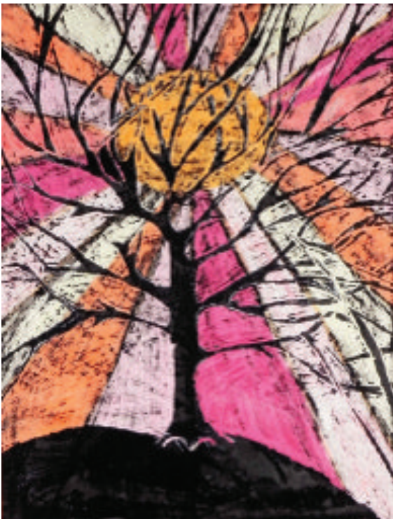
"Tree" Liam Carmody, age 9 - mixed media