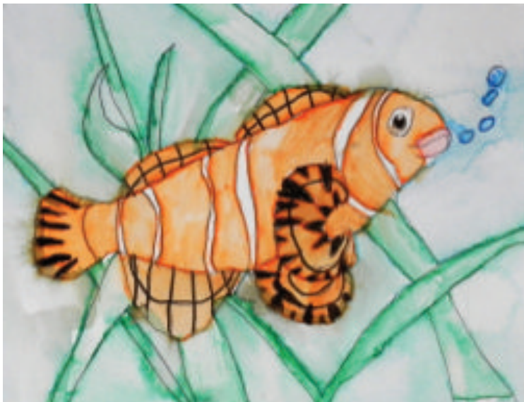
"Clown Fish" Amelia Michko Age 7 - Waterbrushed Marker