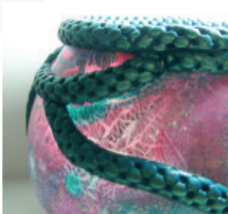
Polymer Clay Examples by Hana Gorman