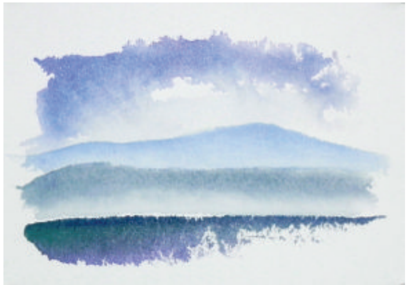
Watercolor by Roger Hill

Take your painting along with you. The instructor will introduce the students to the travel watercolor kit. Postcard size paper and pocket size watercolor sets are the tickets to a creative time on your next vacation.